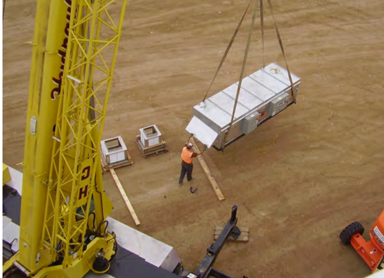
Make Up Air Unit Being Loaded On Roof