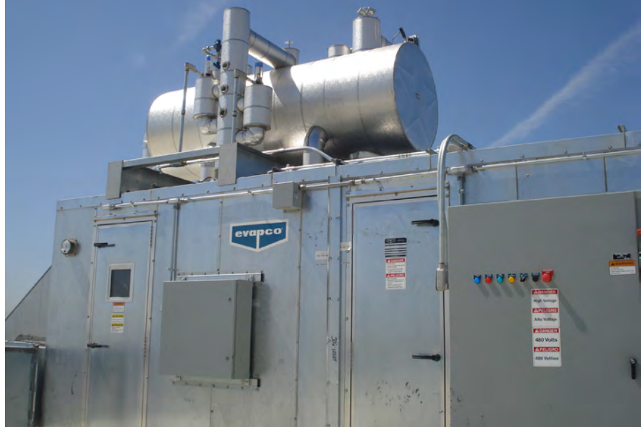
Refrigerated Rooftop Air Handler Units Provide Pressurized Clean Air For the High-Care Processing Areas.