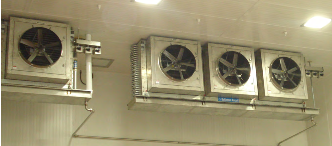
All Evaporator Coils Utilize VFDS Along With Stainless Steel Housings And Swing-Out Motors For Easy Cleaning.